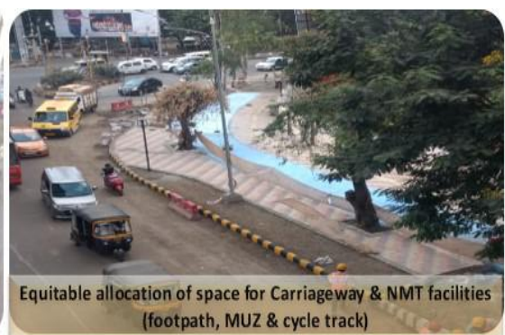
Equitable allocation of space for Carriageway & NMT facilities (footpath, MUZ & cycle track)