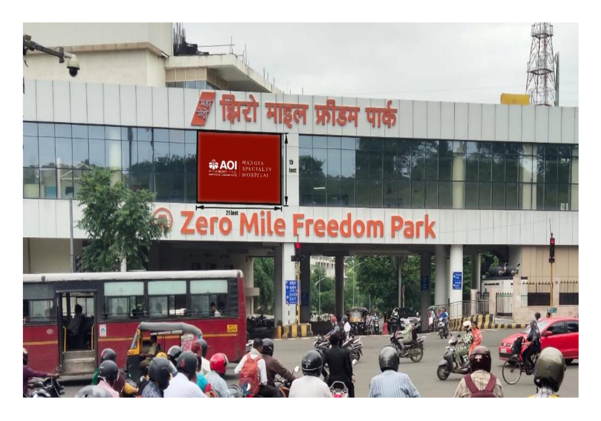
Zero Mile Metro Station