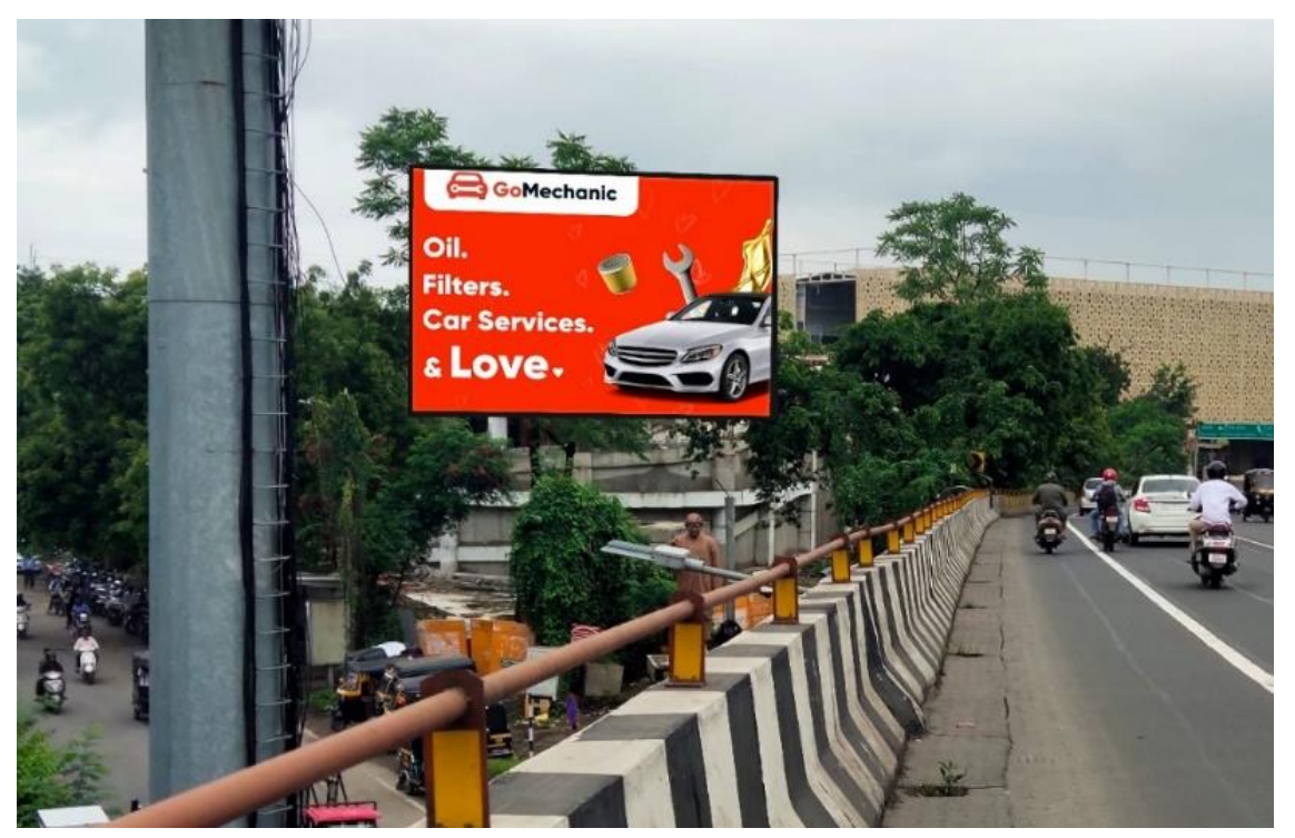
Kasturchand Park Metro Station